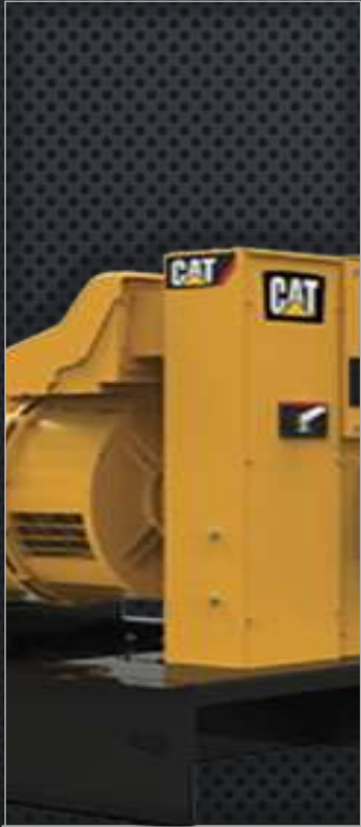
DIESEL & GAS GENERATORS

◇IN STOCK EQUIPMENT-READY FOR RENTAL ◇MAINTENANCE, REPAIR AND OPERATIONS