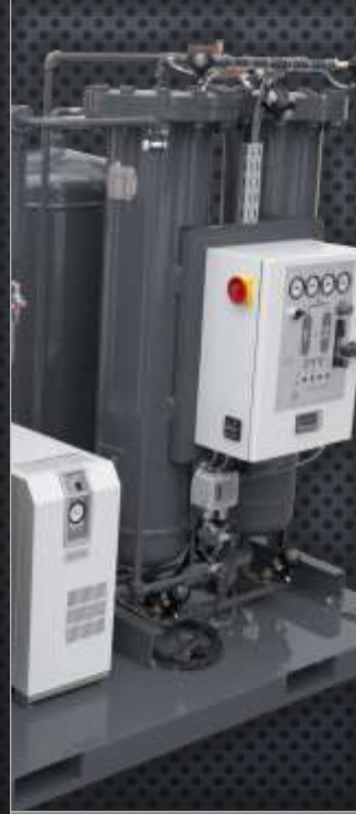
OTHER OIL & GAS SERVICES