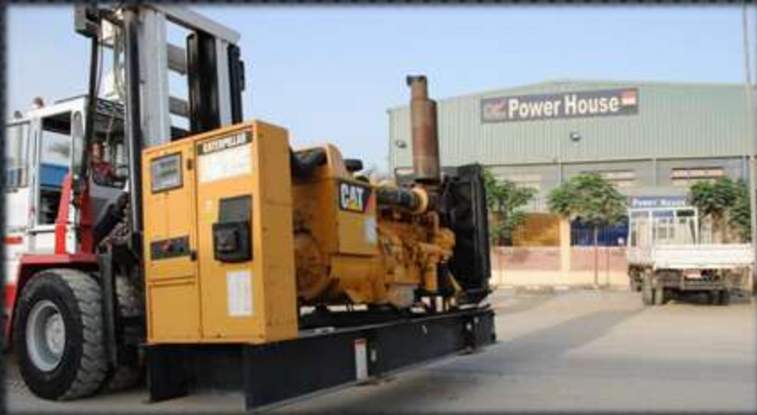
200+ DIESEL GENERATORS

LARGE POWER RANGE: 150 TO 30,000 KVA (50 OR 60 Hz)