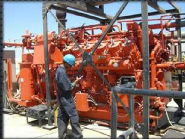
20+ GAS GENERATORS EQUIPPED WITH GAS TRAINS AND GAS FILTRATION SKIDS.