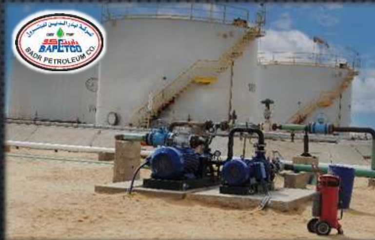
CRUDE OIL PUMPING STATION (BAPETCO: NEAG-1 FIELD)

CRUDE OIL SHIPPING AT 15,000 BPD AND 6,000 BPD