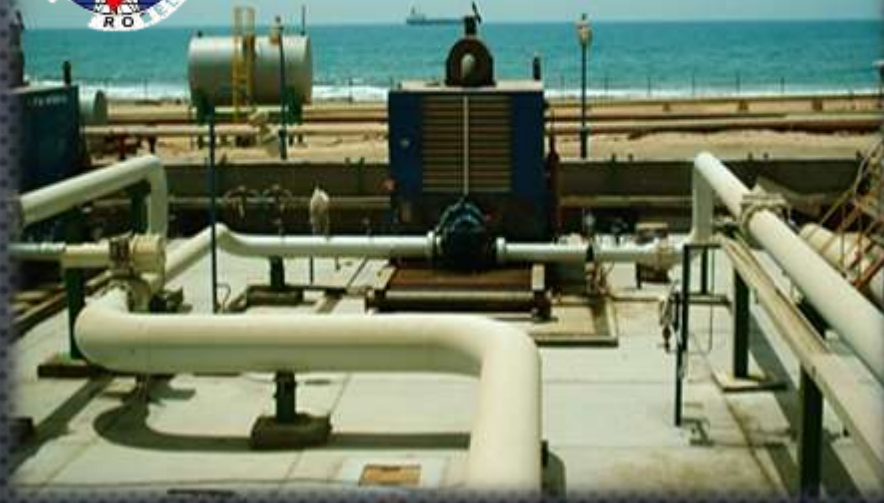
CRUDE OIL SHIPPING PUMPING STATION (PETROBEL)