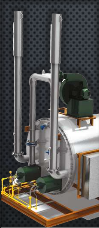
AIR & GAS COMPRESSORS