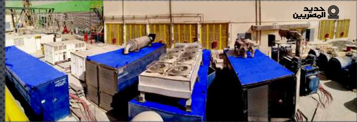
10MW POWER STATION (DIESEL GENERATORS)–EGYPTIAN STEEL CO. SYNCHRONIZED DIESEL GENERATORS POWER STATION (INCLUDING 22,000 V STEP-UP TRANSFORMERS, CABLES, FUEL TANKS AND SYNCHRONIZATION PANELS).

3 SYNCHRONIZED GAS GENERATORS (1 MW EACH) AND 2 DIESEL GENERATORS (1.25 MW EACH).