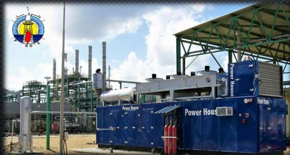
1.5 MW POWER STATION–PETROBEL SYNCHRONIZED DIESEL AND GAS GENERATORS