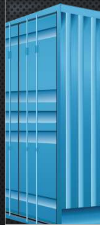
ELECTRO- MECHANICAL CONTRACTING