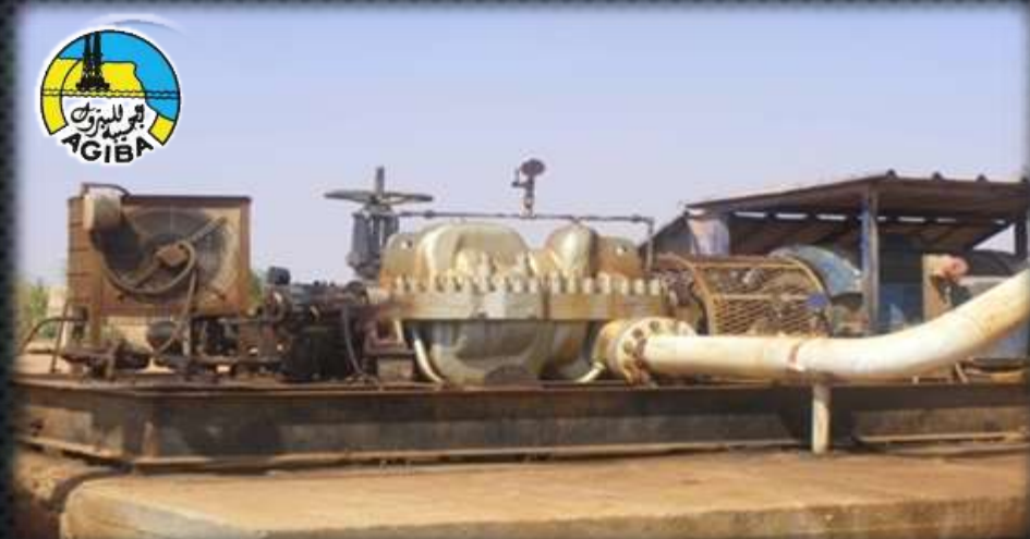
WATER INJECTION PUMPING STATION (AGIBA: MELIHA FIELD)

BYRON JACKSON PUMPS DISPOSING 20,000 BPD OF WATER IN A DISPOSAL WELL AT A 750 PSI DISCHARGE PRESSURE