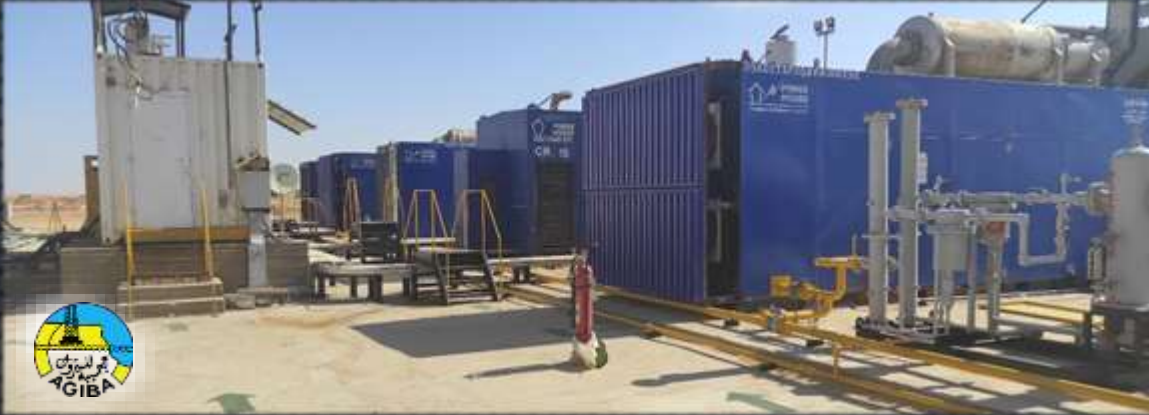
POWER STATION (GAS GENERATORS)–AGIBA PETROLEUM COMPANY (SWM FIELD)

◇IN STOCK EQUIPMENT-READY FOR RENTAL ◇MAINTENANCE, REPAIR AND OPERATIONS