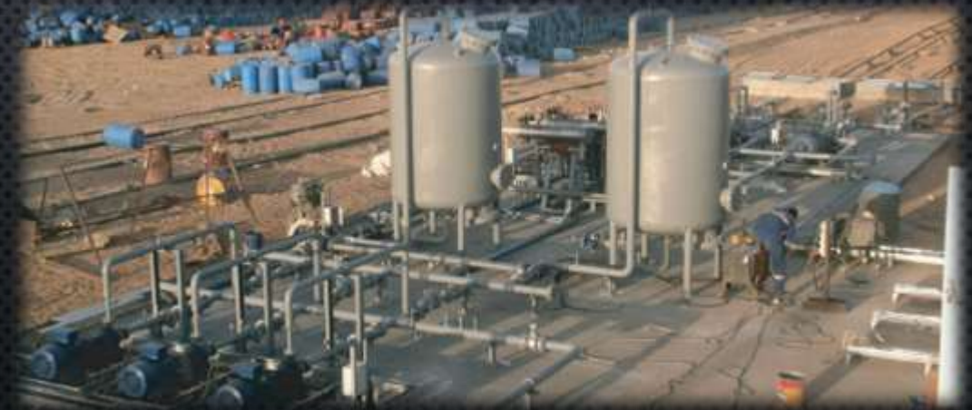
WATER FILTRATION & PUMPS AREA-DAPETCO