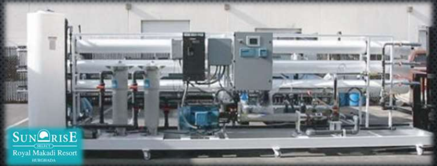
BOO WATER DESALINATION STATION (CAPACITY OF 1,200 M3 PER DAY) – MAKADI RESORT (HURGHADA)