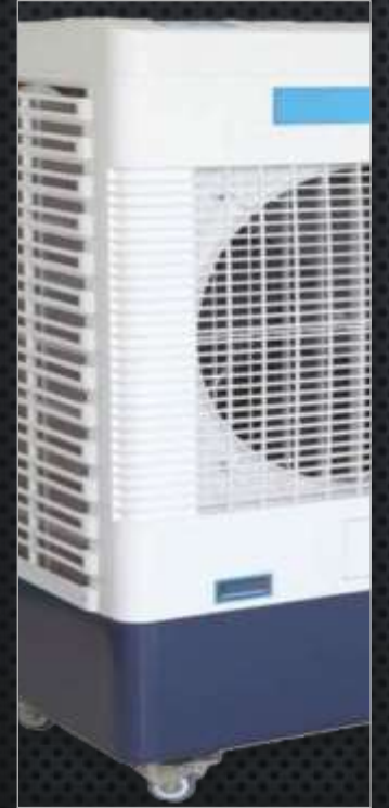
OTHER PRODUCTS & SERVICES