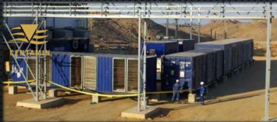
LOAD BANKS TESTING 8 MW POWER STATION (DIESEL GENERATORS)-SOKARI MINE

STEP-UP AND STEP-DOWN TRANSFORMERS COVERING A WIDE RANGE OF VOLTAGES FROM 380V TO 22,000V.