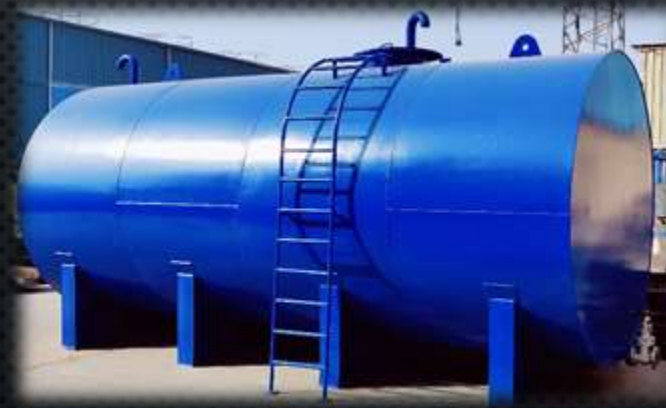
WAREHOUSE STEEL STRUCTURE FABRICATION AND INSTALLATION- TAMEER COMPANY STORAGE FACILITY (6TH OCTOBER CITY)